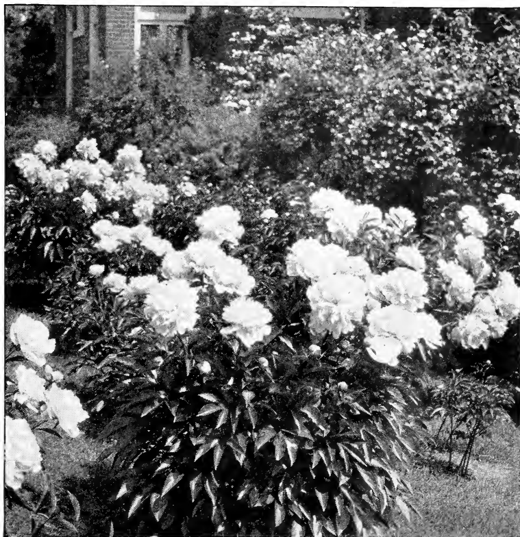
Albert Crousse Peonies